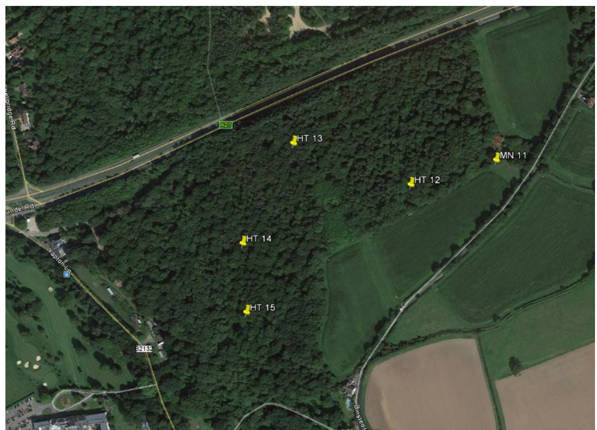
Figure 2 – showing trap locations on 18th August