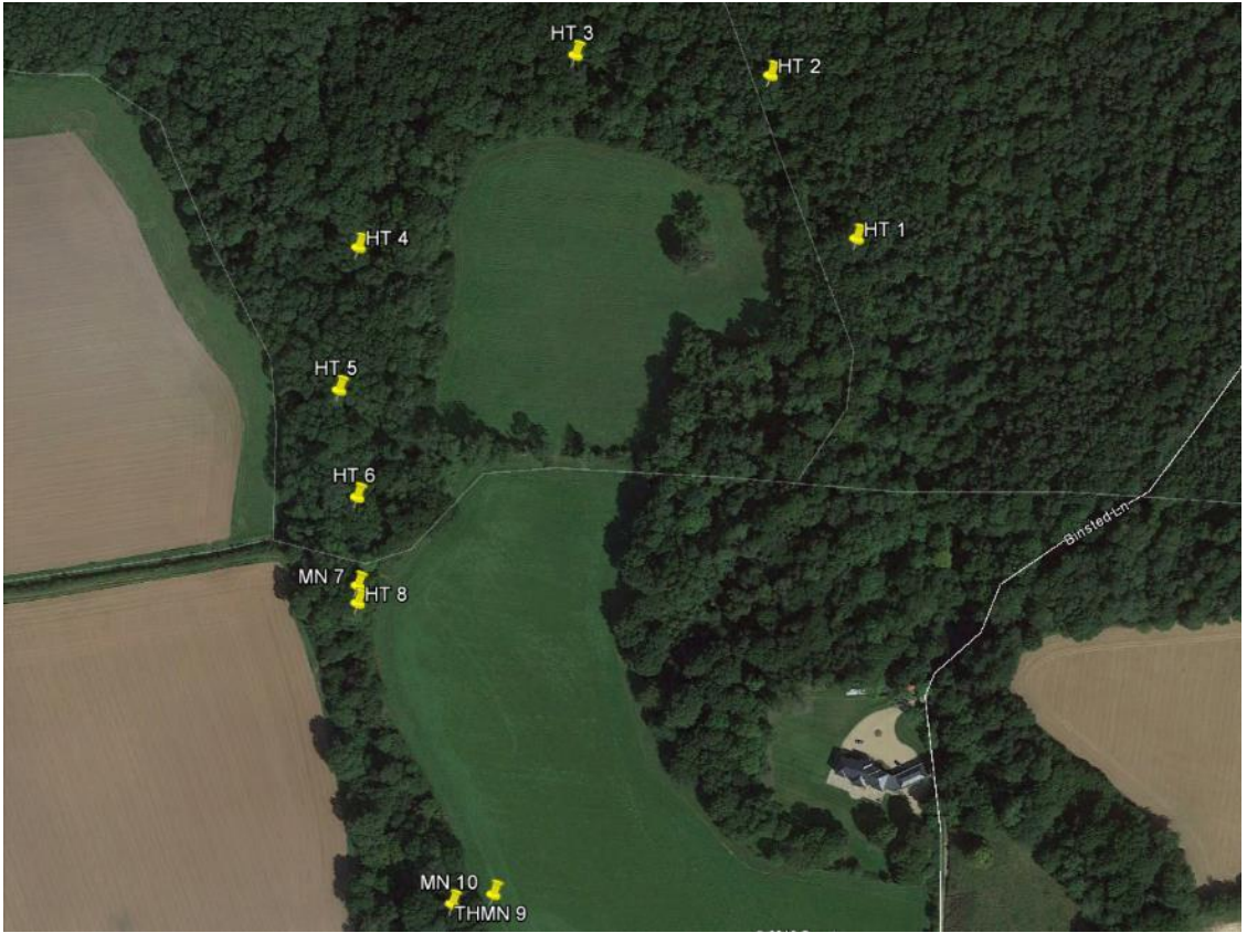
Figure 1 – Showing distribution of traps on 31<sup>st</sup> July. (HT-Harp trap, MN-Mist Net, THMN – Triple high mist net)