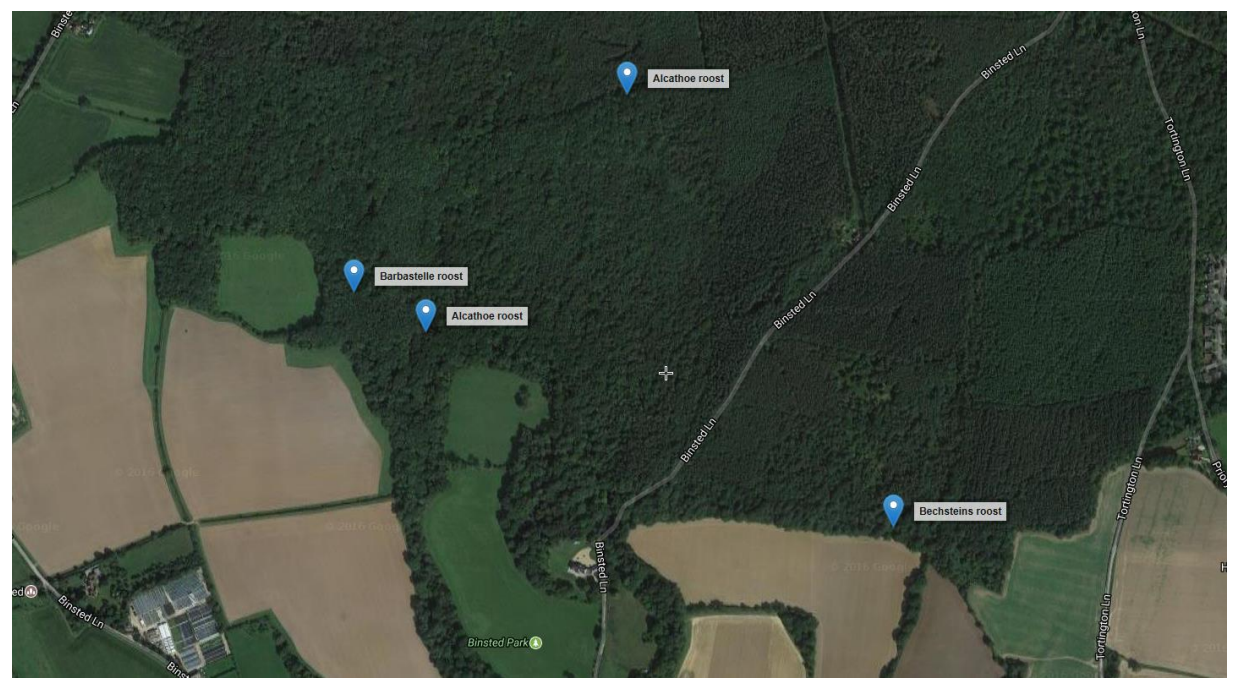
Figure 4 – showing roost locations for Alcathoe, Barbastelle and Bechstein's

2<sup>nd</sup> August – an additional emergence survey was conducted having enabled access to observe the roost feature fully and a total of 26 bats were observed emerge. The bat was confirmed using the same roost after tagging from the 1<sup>st</sup> to 6<sup>th</sup> August