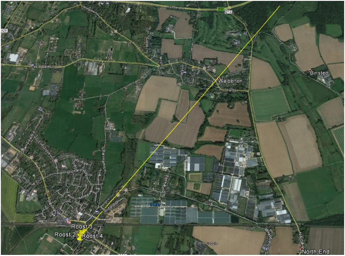
Figure 5 – showing the 3.3km distance from the trap site to roost locations.