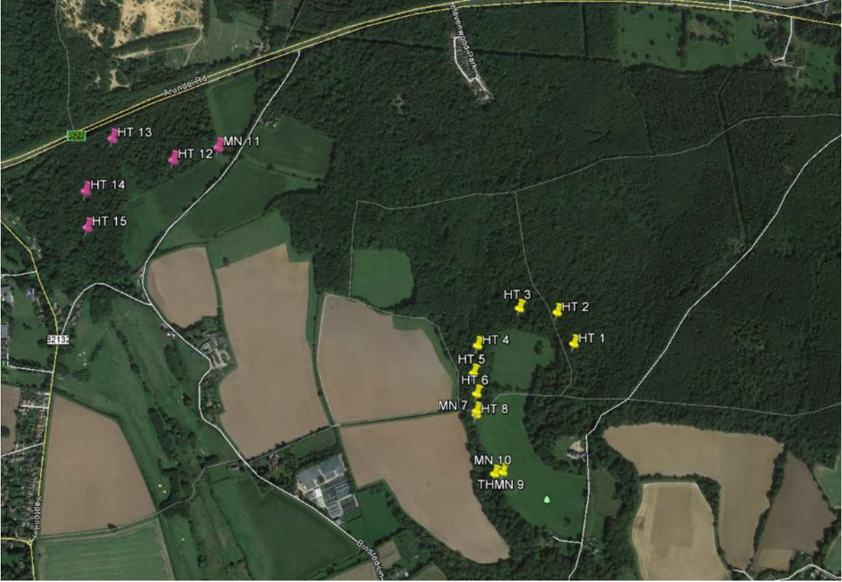
Figure 3 – showing trap locations from both nights throughout the site